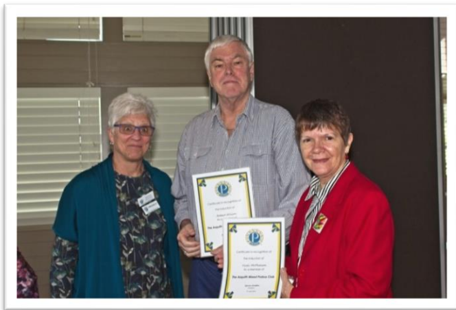
New members were welcomed by our President